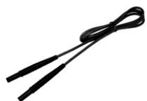
Test lead 0.7 m, black (banana plugs)