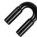
4x configuration jumper