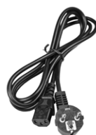
Mains cable with IEC C13 plug